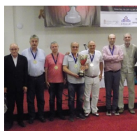
EUROPEAN SENIOR TEAM CHESS CHAMPIONSHIP 2017