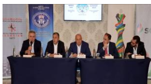
WORLD CHESS CUP 2017