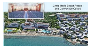
2 ND ECU CONGRESS AND ECU GENERAL ASSEMBLY