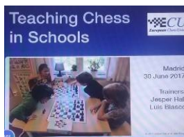
FIRST ECU CHESS CAMP FOR TEACHERS